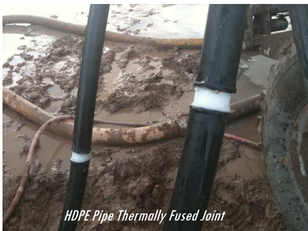
HDPE Pipe Thermally Fused Joint