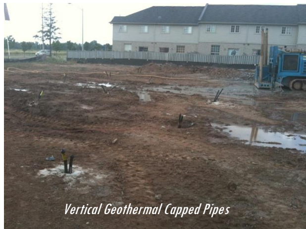
Vertical Geothermal Capped Pipes