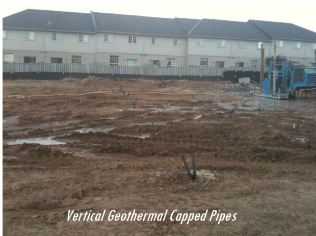
Vertical Geothermal Capped Pipes