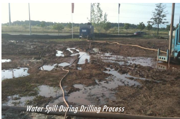
Water Spill During Drilling Process