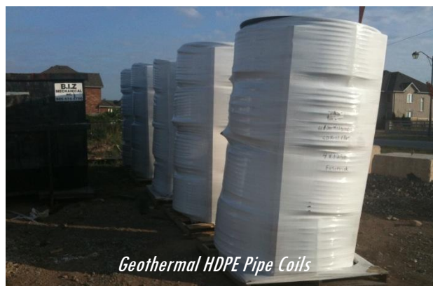
Geothermal HDPE Pipe Coils